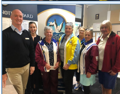
PELICAN WATERS LADIES FIESTA ON 8TH JUNE ROUND WINNERS

"It's paradoxical that the idea of living a long life appeals to everyone, but the idea of getting old doesn't appeal to anyone." - Andy Rooney