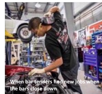
When bar tenders find new jobs when the bars close down