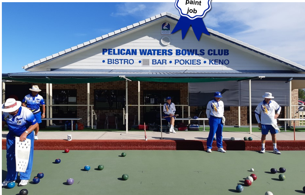
The Club recently had new signage installed on the northern façade of the main building.