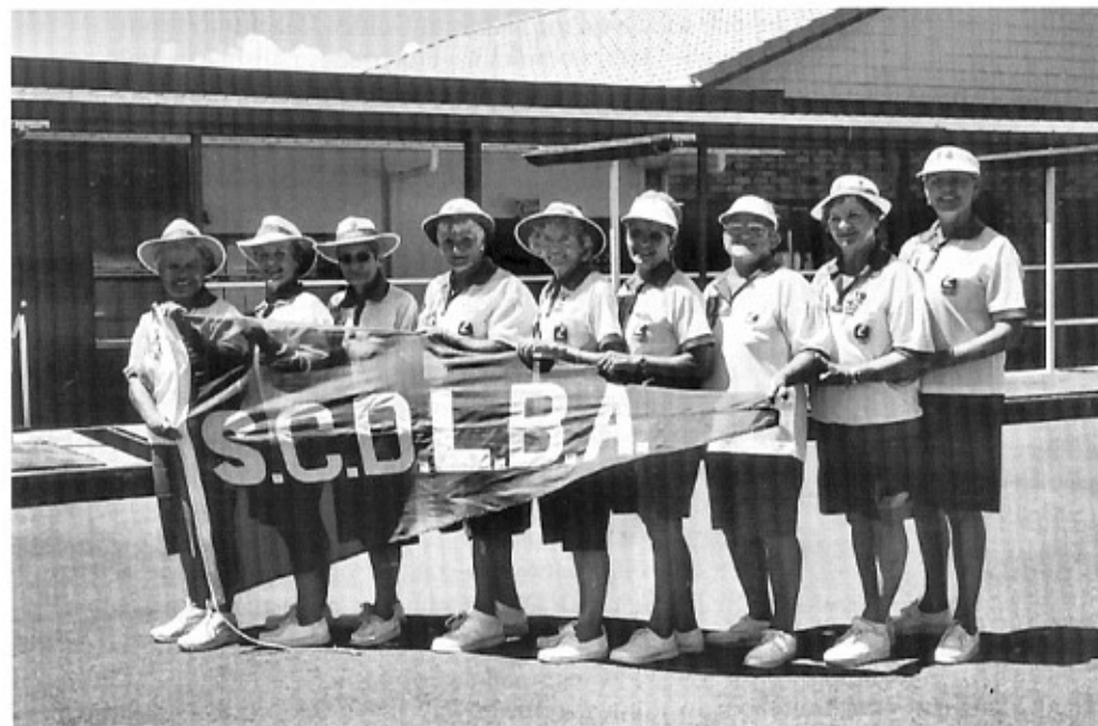
Winners Purple Division—2004

The Ladies best years were 2003 & 2004. In 2003 they won the zone final of the Taylor Bowls Super Challenge competition. This was followed by the Ladies winning the Division 1 Purple Pennant in 2004.