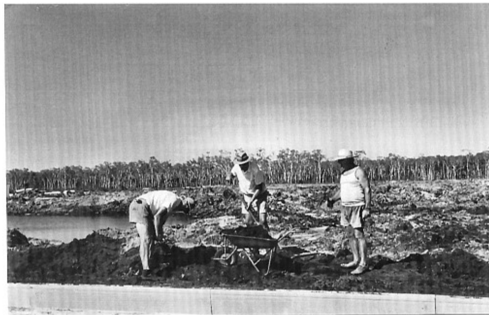
This is part of the site in 1980 that they hoped to make into a Bowls Club