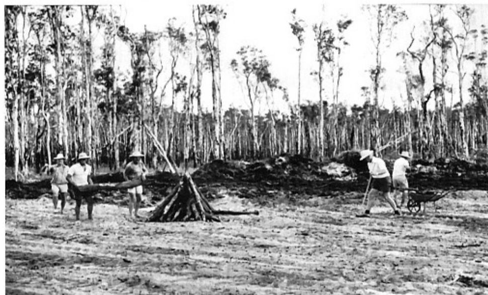
Volunteers clearing and burning the site which was to be the Bevan Henzell Green

The clubhouse was supplied by Monarch Modular Homes Pty. Ltd. in kit form and was erected to the lockup stage in 12 days in March 1982.