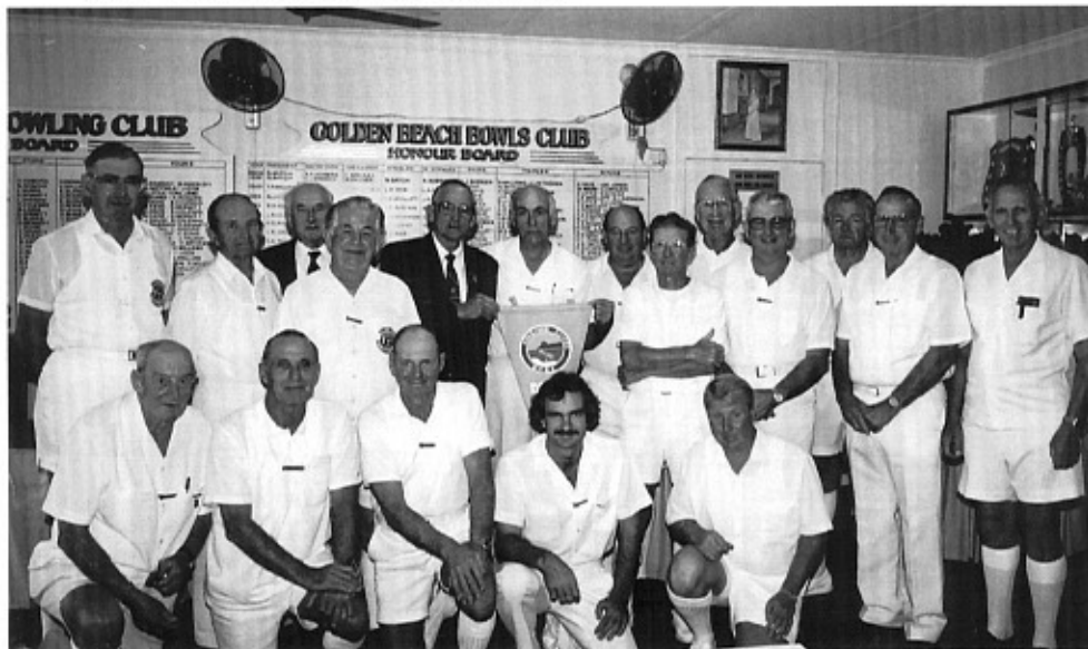
Winners Division 6 Pennant 1993