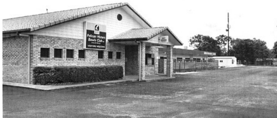
Clubhouse on this site in 2005

The Men and Ladies of Golden Beach Bowls Club, now Pelican Waters Bowls Club, can be justly proud of the Club they built over the last 25 years mainly with voluntary labour.