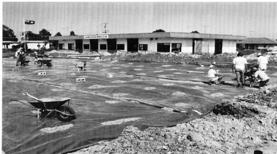
Raising the Syd Lingard green—Laying drain pipes before placing the gravel.

The Syd Lingard green was raised in 1991 and the Bevan Henzell green in 1992/3. The final cost of both greens was approx. $120,000. This cost would have doubled if it wasn't for the thousands of man hours volunteered by Club members.