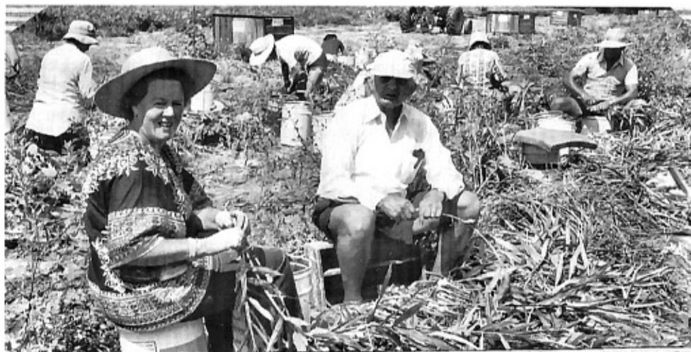
The "Ginger Pickers" Members picking ginger to raise money for the Club

The ginger picking and Anro Asia photos show how the members took advantage of every opportunity to raise funds for the Club.