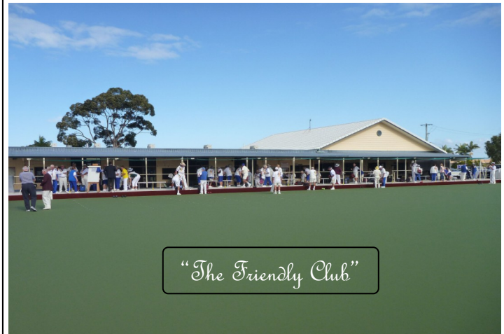
"The Friendly Club"