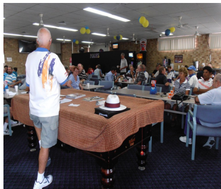
A wonderful turn out for "Come and Try Day" thanks to all who helped on the day.